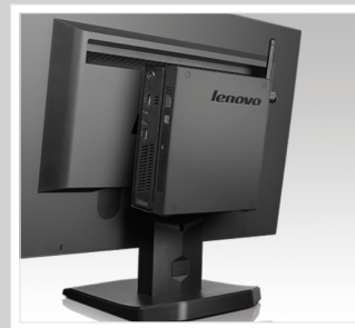
MORE PRODUCTIVE, LESS CLUTTER Integrated stereo speakers and VESA bracket for a Tiny PC enable optimal space management