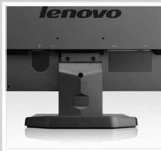
MINIMALISTIC DESIGN Fits in any environment with a small foot print and tilt-only, tool-less detachable stand