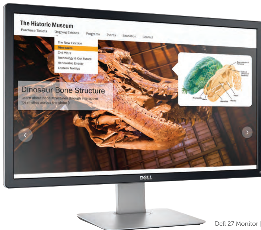
Dell 27 Monitor | P2714H (27", 68.6 cm VIS)