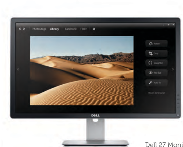
Dell 27 Monitor | P2714H (27", 68.6 cm VIS)